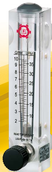
FMP...V / FMP...VR

Wide range of available products. Contact us for more information.