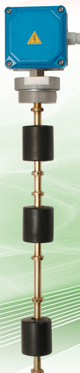
LM3/4 GSA - GA - GTA