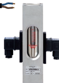
IF...VE - IF...V2E